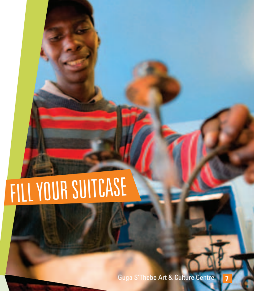
Guga S'Thebe Art & Culture Centre 7