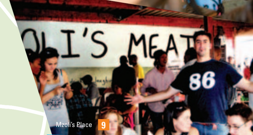
Mzoli's Place 9