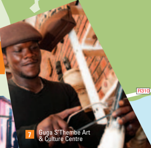
7 Guga S'Thembe Art & Culture Centre